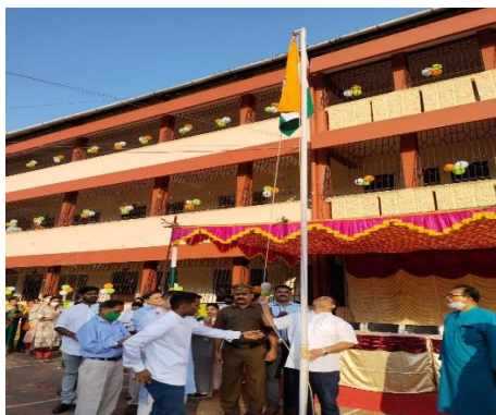
Flag hoisting on the occasion of Goa Liberation Day

◆ The Students’ Council organised Goa Liberation Day Celebration on 19 th December to commemorate 60 years of Liberation.