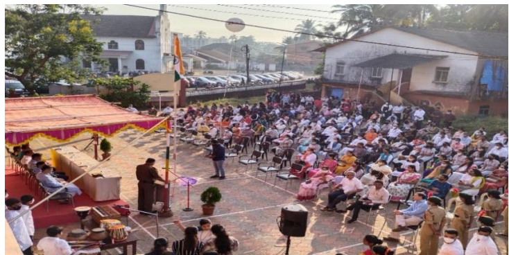
Ariel view of Goa liberation day celebrations