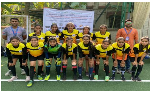
C.E.S.College Women’s Futsal Team 2021

◆ CES College Football Men and Women teams participated at the Inter collegiate Futsal Championship 2021, organised by Goa Football Association in collaboration with M.ES, Dhempo and Nirmala College held in Ribander, Goa. The women’s team emerged as the semi finalists.