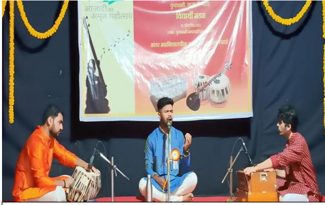
A participant performing at Bhav-Geet Competition