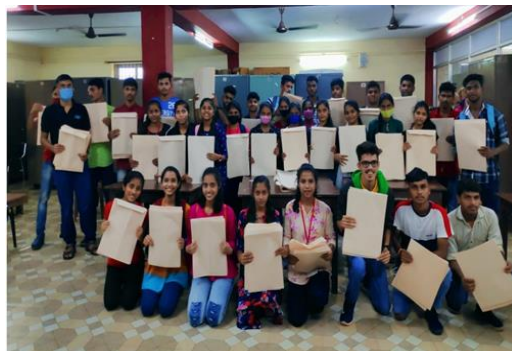
Students demonstrating their hand-crafted envelopes.

With the objective of helping the college examination section the NSS unit of the college conducted an envelope making activity. A total of 238 envelopes were made by the volunteers which are used to pack the examination answer papers. 46 volunteers participated in this activity.