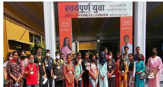
Students and teachers at ‘Swayampurna Yuva Job Fair’