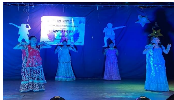
Students participating in Group Dance Competition for Winter Fiesta .