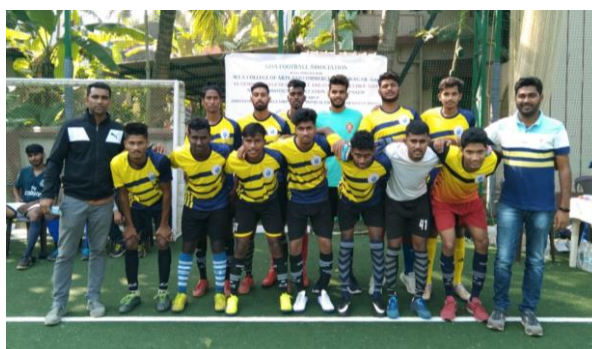
C.E.S.College Men’s Futsal Team 2021

◆ The Department of Economics organised an ‘Inter-class Essay Writing Competition’ on 20 th December,2021, to encourage critical thinking and writing skills of the students and inculcate awareness about current affairs.