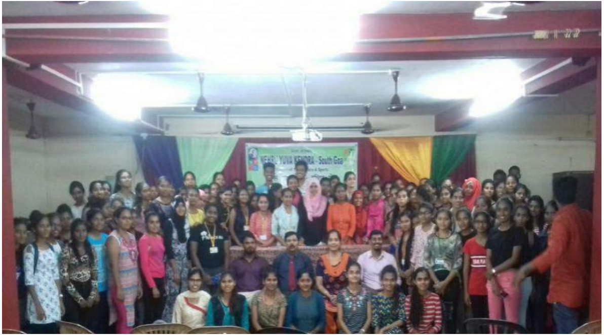
Participants of the Workshop on 'Youth Development'