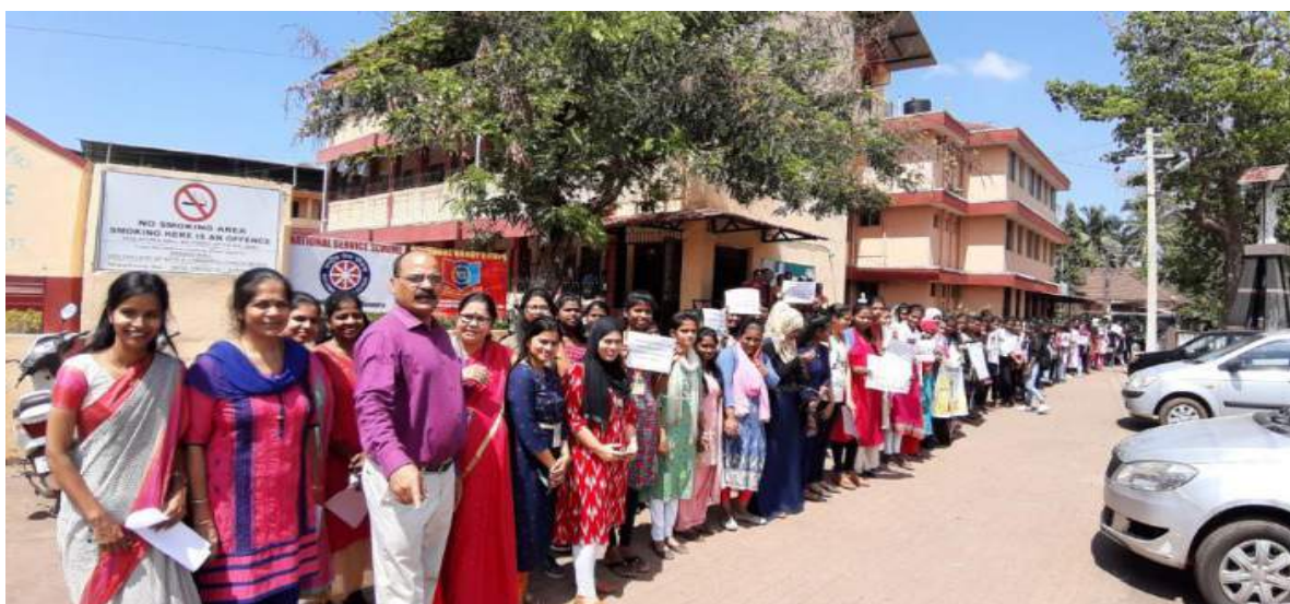
Celebration of Womens day