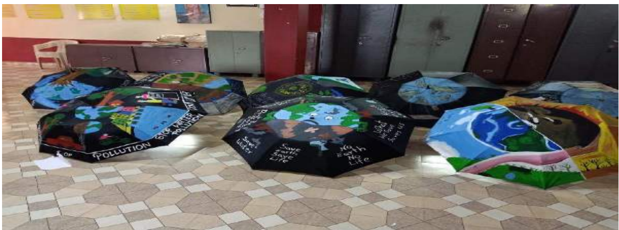
Umbrella painting competition