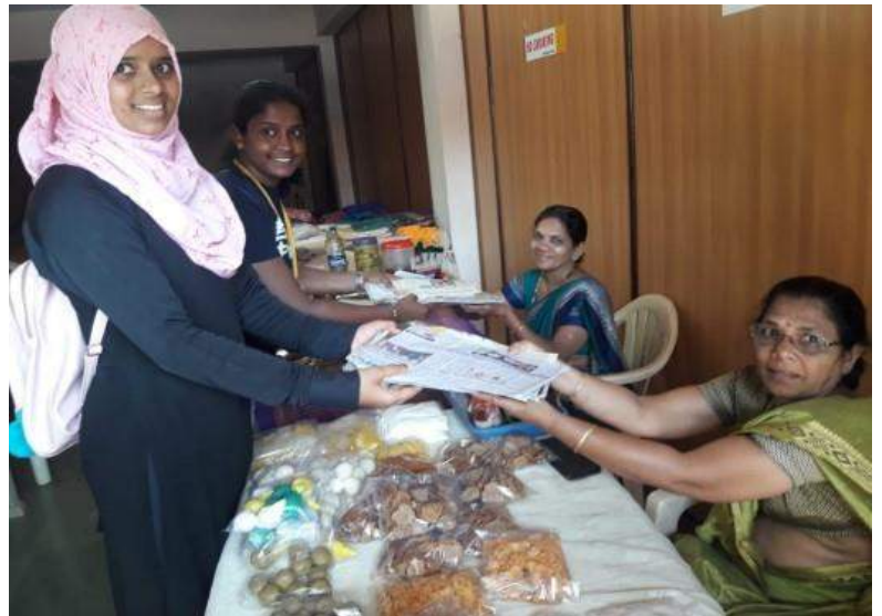
Distribution of paper bags to vendors in Cuncolim market