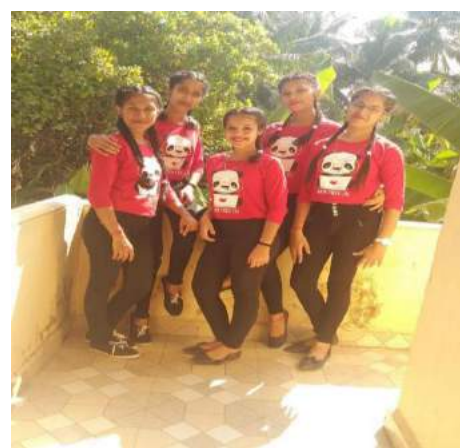
Glimpses of the Winter Fiesta