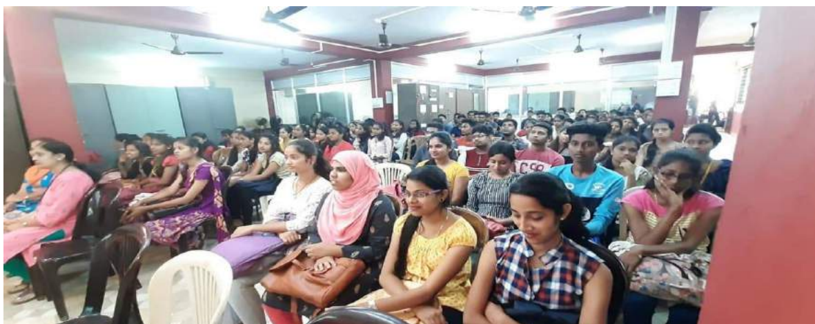
Audience at the Inaugural programme Ék Bharat Shresth Bharat