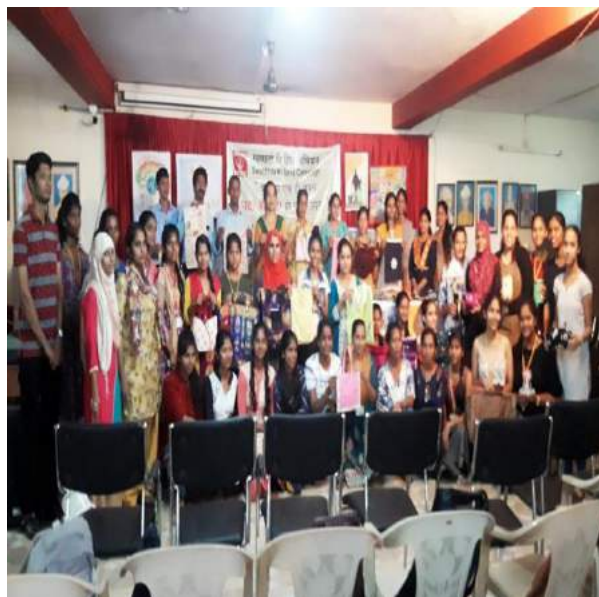
Workshop on 'Personality Development'.