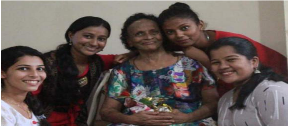
Expressing concern and care towards our senior citizens.... Quality time spent with inmates of IPA, Cuncolim