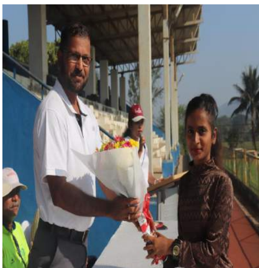
Welcome accorded to the chief Guest.