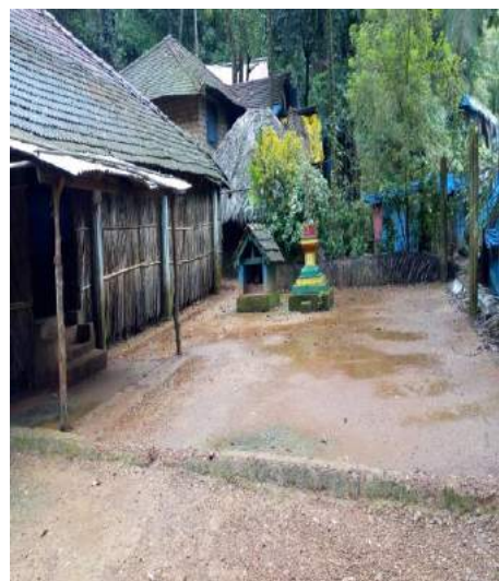
A field trip to Gaodongrim