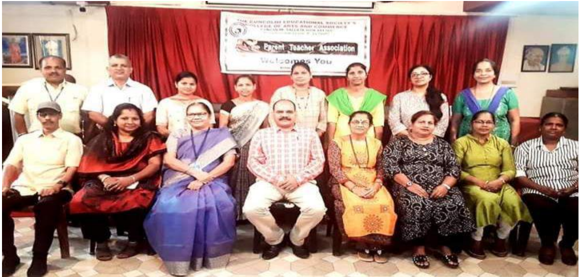
The new Executive Committee, PTA