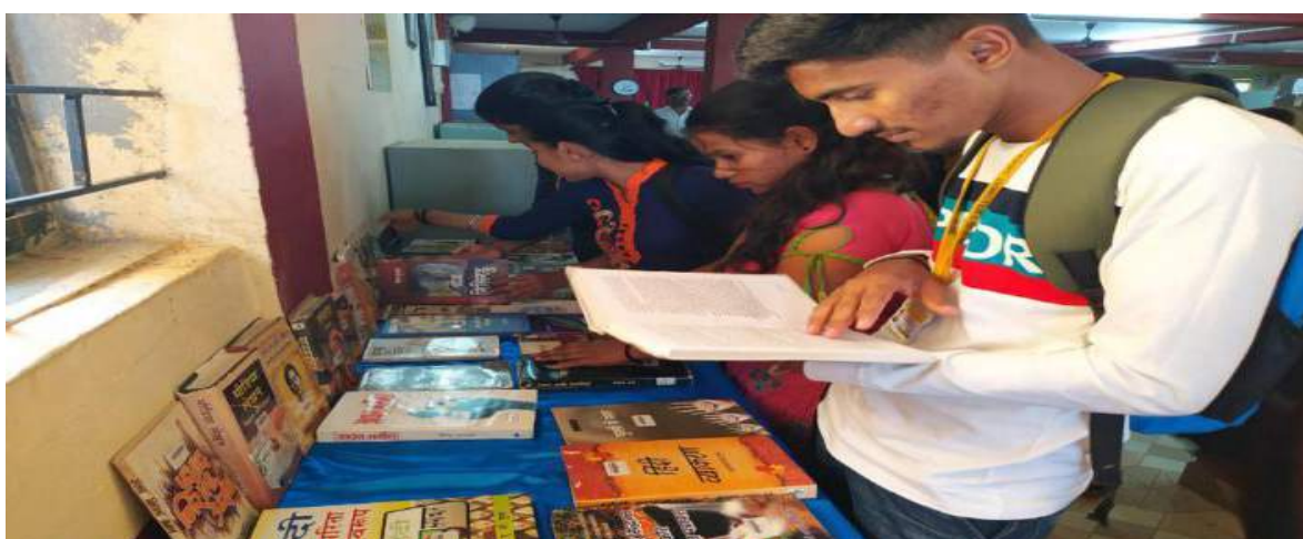
Students browse through books at a Book Exhibition in the college premises.