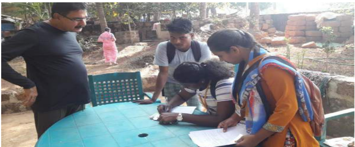
UBA survey in adopted villages.