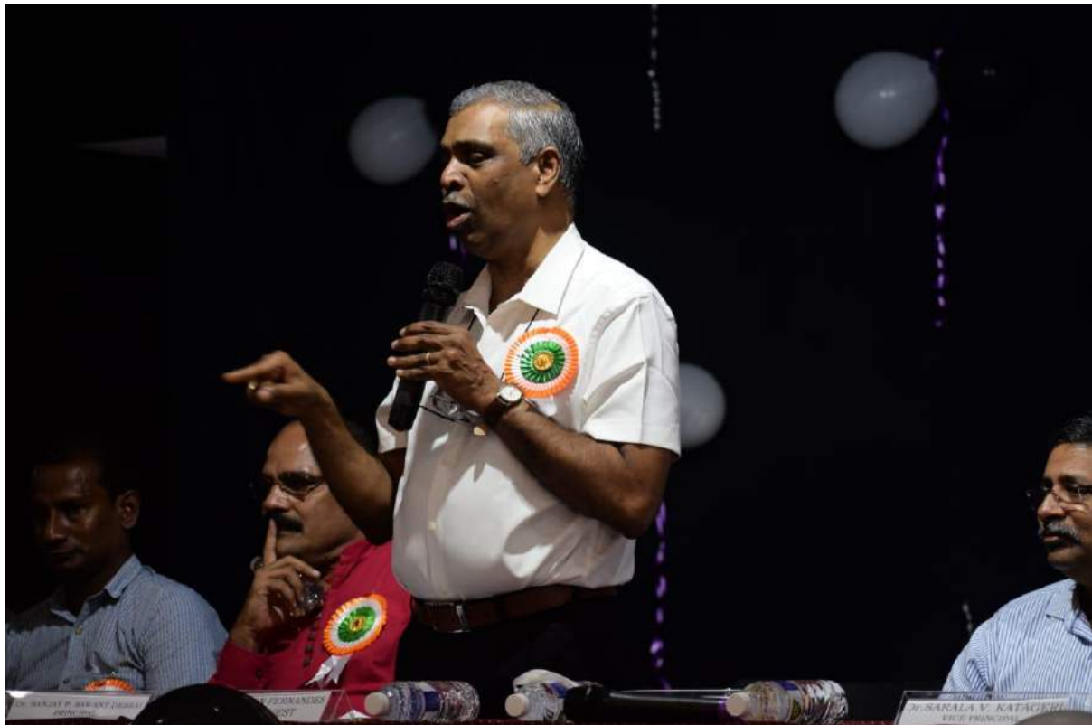
Chief guest speaks -Inauguration of Students Council and Cultural Council.