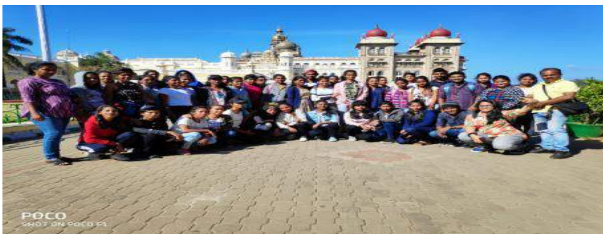
Students on a study tour.