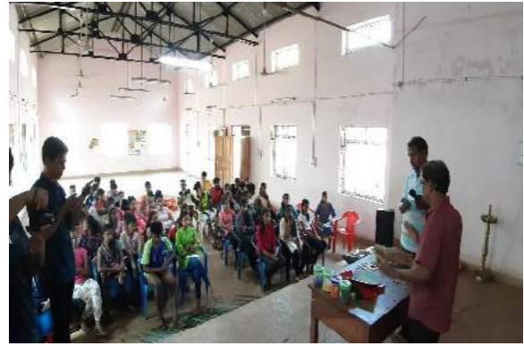
Activities conducted during the special camp in Morpilla Village