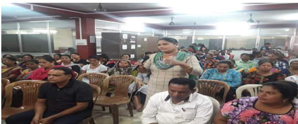
Parents express their views at the AGB meet of the PTA.