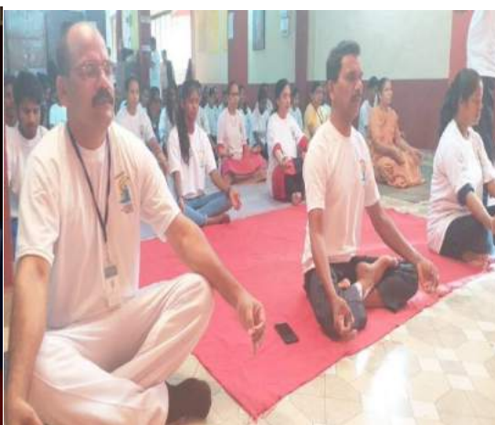
Celebration of International Yoga Day.