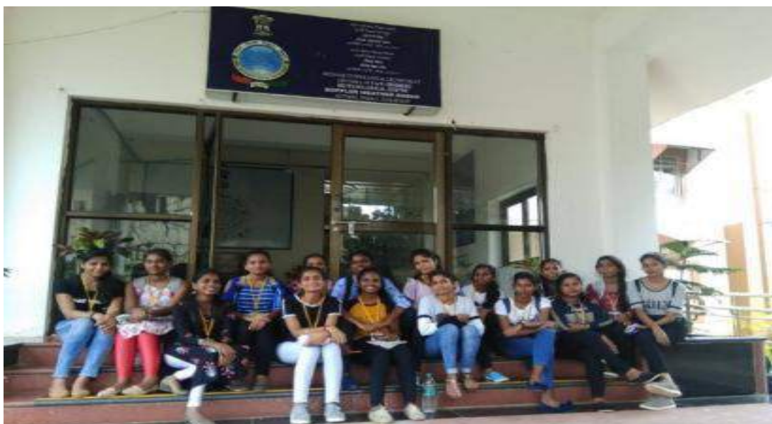
Students on a Study tour

Photo Gallery.....Activities conducted by Departments, Committees, cells, associations, clubs, Career Guidance and Placement cell