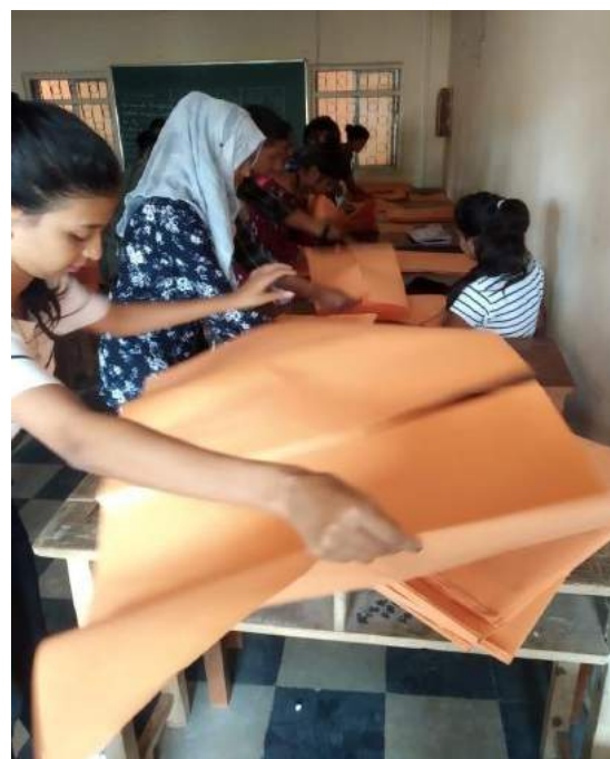
Paper Envelope Making