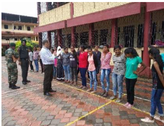
Photo Gallery....NCC unit.

13 Cadets volunteered to be a part of Government efforts towards management of COVID 19 pandemic and helped OPD patients in maintaining social distancing at Hospicio hospital, Margao-Goa.