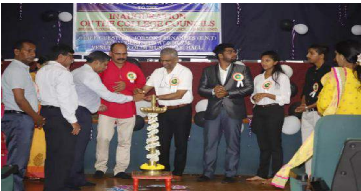
Inauguration -Students Council