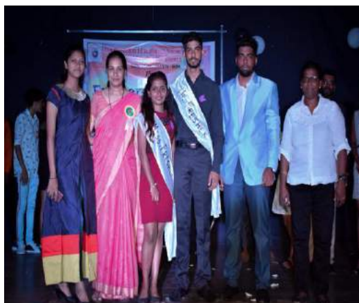
Ms. and Mr. Fresher