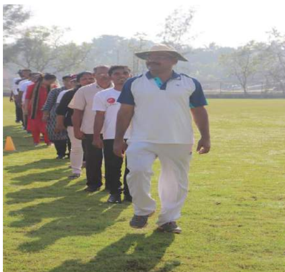
Participation of non teaching staff members.