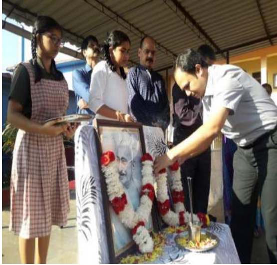
Gandhi Jayanti and birth anniversary of Lal Bahadur Shastri.