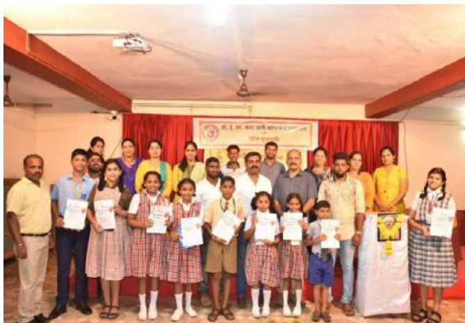
Participants of the Story Telling competition.