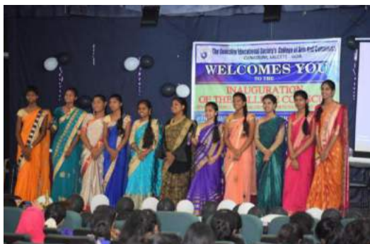
Students welcome the gathering