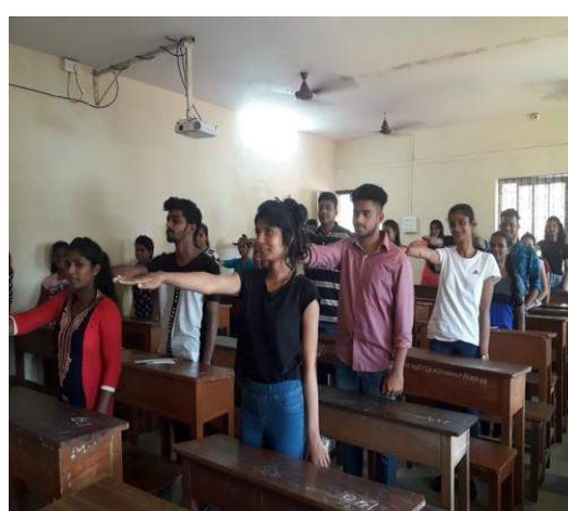
Swatchata Oath administered to volunteers