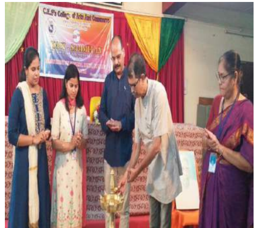
Inaugural of the annual Kavi Sammelan.