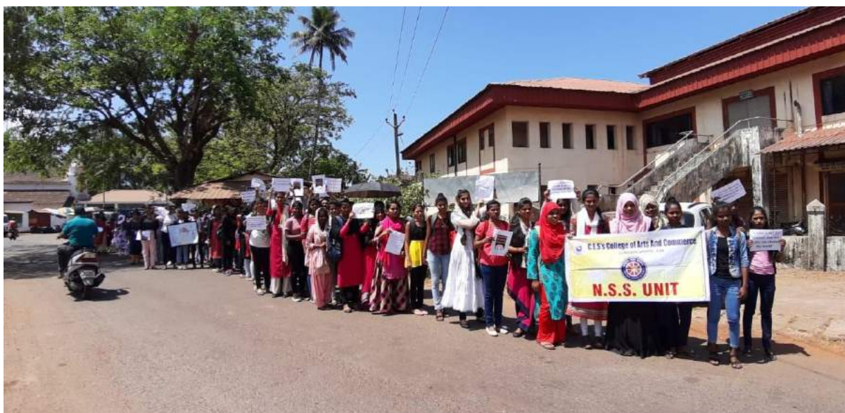
Rallies undertaken to generate awareness on ‘Save Environment, Save Life’ ‘Green India, Clean India’, AIDS awareness, Unnat Bharat Abhiyan, Womens Empowerment.