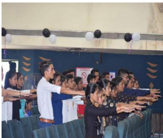
Oath taking by the new council