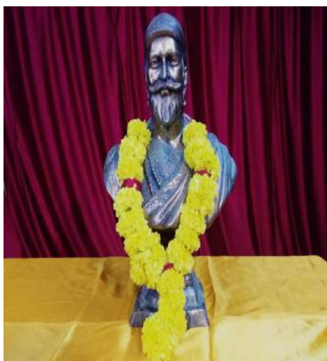
Shiv Jayanti Celebrations.