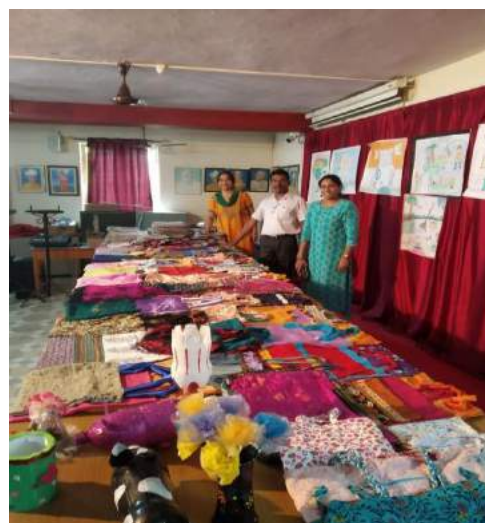
Swachhata Hi Seva Exhibition in collaboration withONGC.