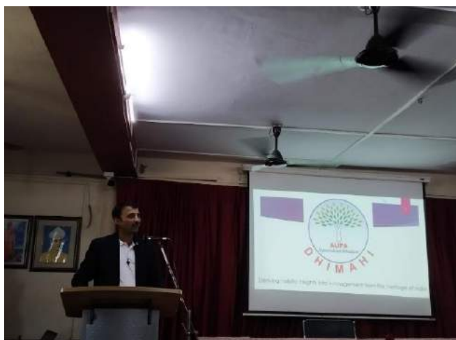
Swami Chidanandaji addressing the topic on ‘Total Well Being’