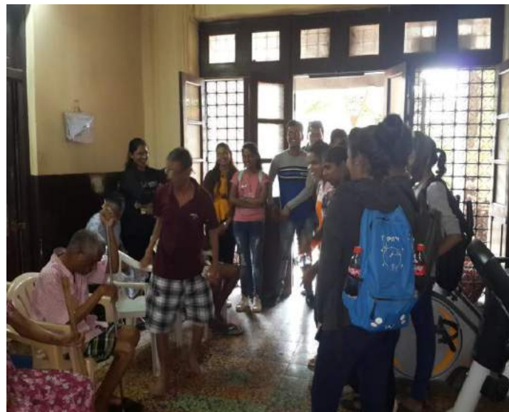
On a visit to the old aged home.