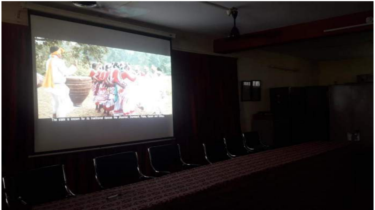
Sreening of a short film 'Culture of Jharkhand'