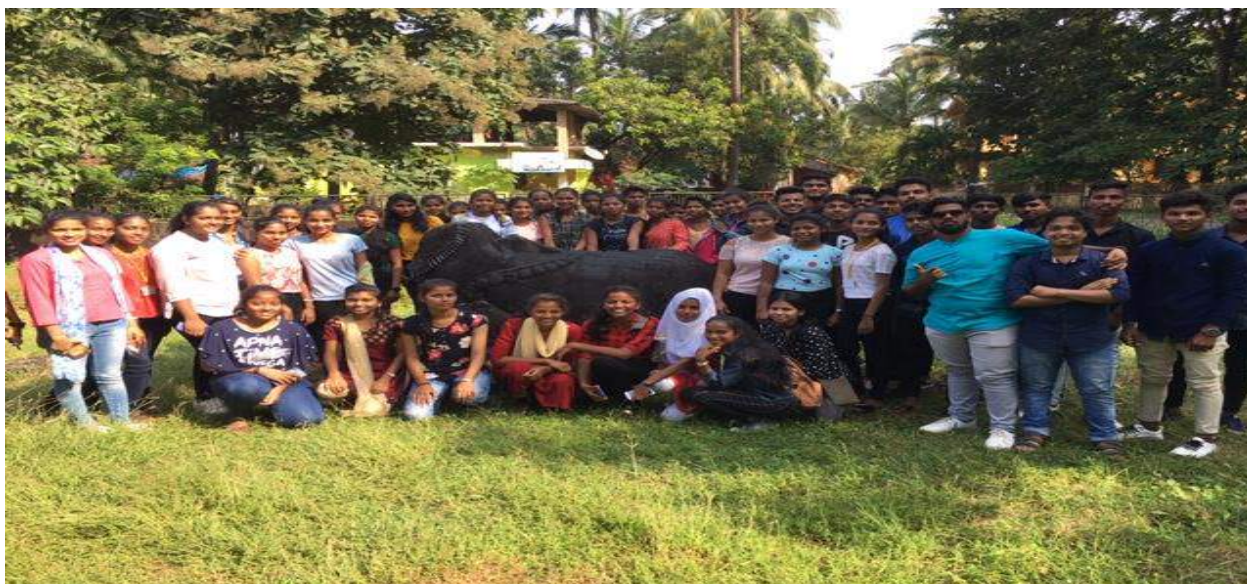
Study tour to Heritage sites in Chandor