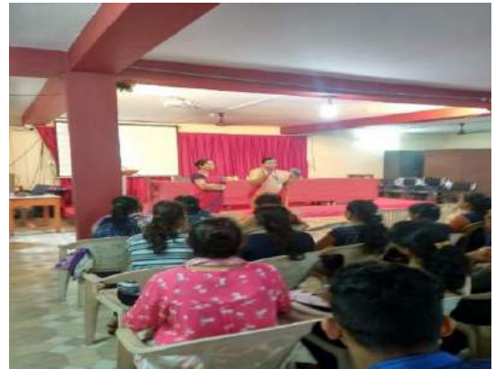
Students attend a session on 'Writing Project Reports effectively'