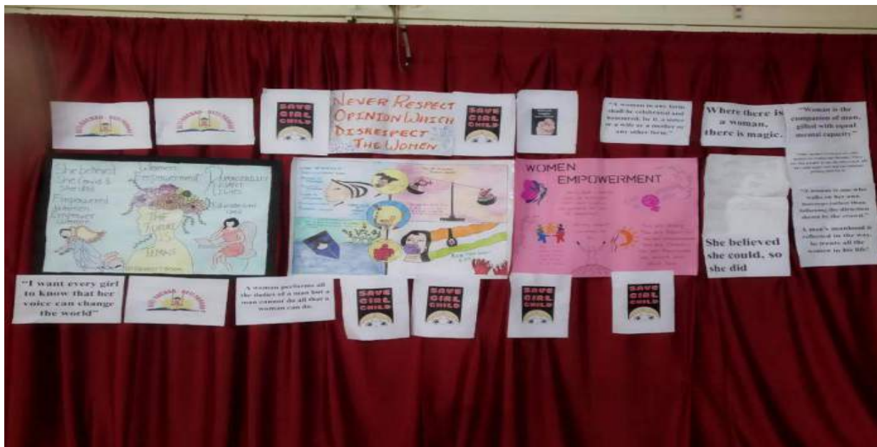
Posters prepared by students as a part of competitions organised by the Gender Champions Club.