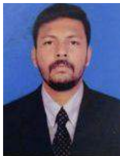
Shri. Shambhau Sapre Examination Section