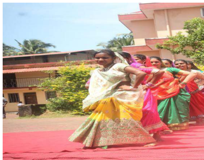
Glimpses .... Monsoon Fiesta