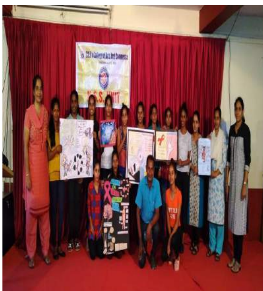
Poster Competition AIDS Awareness.