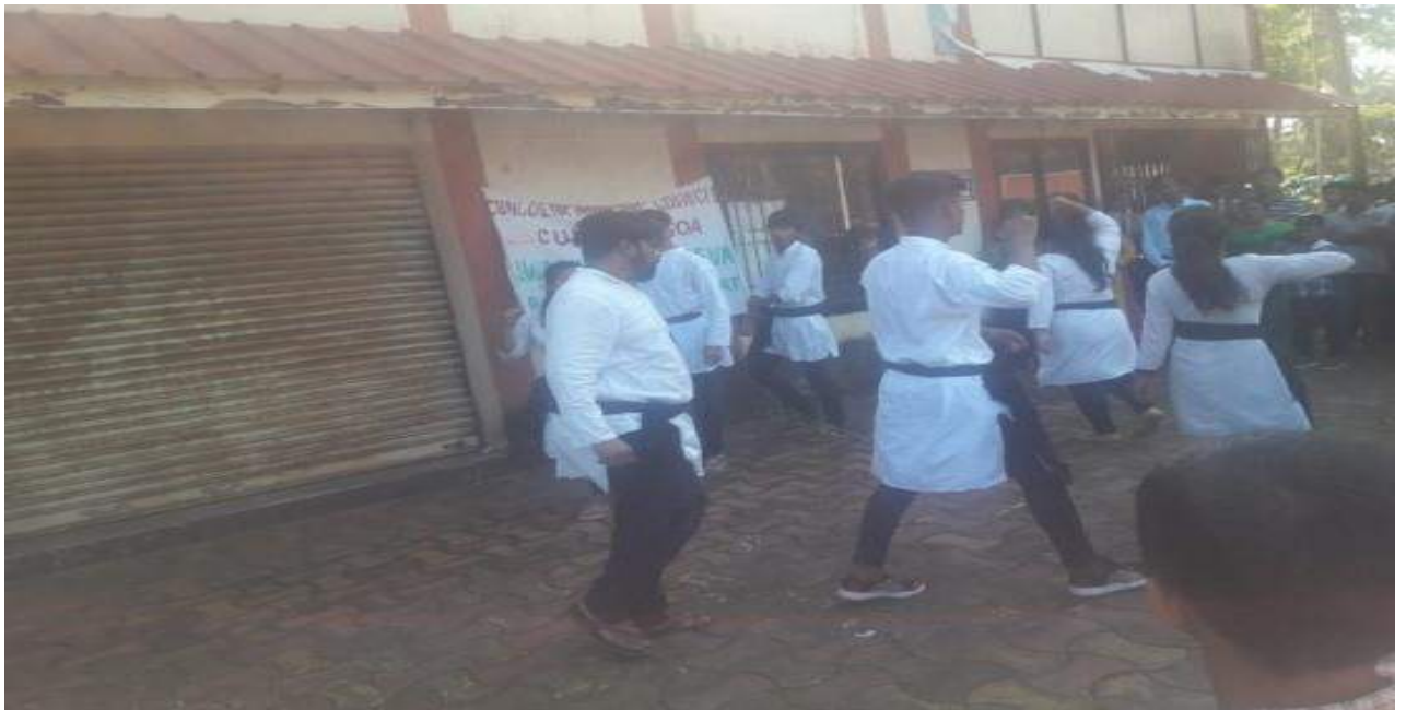
Street play on 'Swacchata hi Seva'