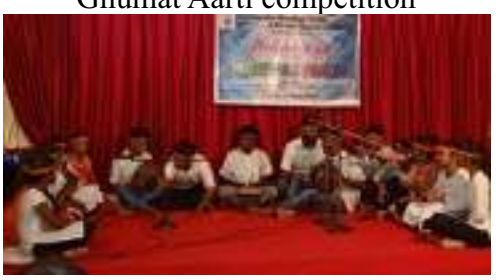
Yuva Sangram 2<sup>nd</sup> Edition 2020.