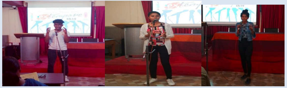
Participants of the Extempore Competition

EXTEMPORE 2K19. Literary guild organised an elocution competition 'Extempore 2019' on 9<sup>th</sup> March, 2019.Participants were given a choice of topics to speak for minimum four and maximum 5 minutes.