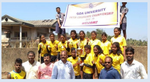
Kho-kho women's team champions consecutively for 4 times at the tournament organised by goa university

The Kabaddi Team (men) won the championship at the Tournament, organised by GovernmentCollege Pernem Goa.They also secured the Runners up position at Inter-Collegiate tournament, organised by the Goa University.