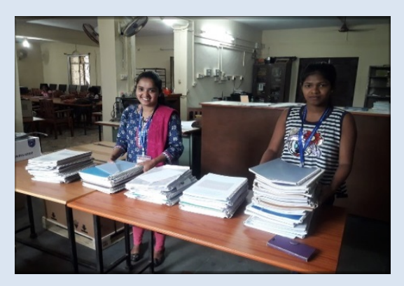
Volunteers cleaning the Library

A classroom cleaning drive was held on 2<sup>nd</sup> and 3<sup>rd</sup> August 2018 in the college. A total of 203 volunteers participated in the drive, comprising of 51 male and 152 females.