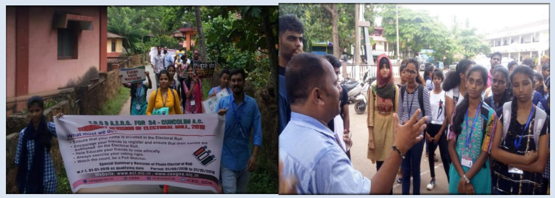
Vounteers participate in the rally and talk on Summary Revision of Electoral Roll 2018.

TALK AND RALLY ON REVISION OF ELECTORAL ROLL 2018: