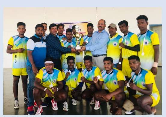
The Kabaddi Team (men's) won the championship at the Tournament, organised by GovernmentCollege

The college womenKho-Kho Team emerged champions for 4<sup>th</sup>consecutive time at the tournament organised by Goa University. The college men Kho-Kho team secured the Runners up position for the third time at the tournament organised by Goa University.