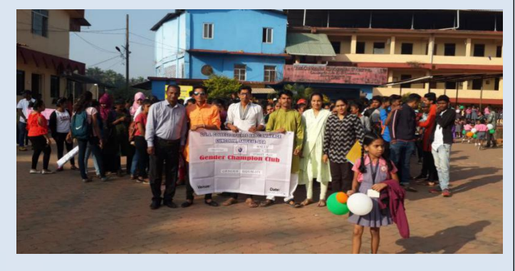
Rally to generate awareness on on Gender Equality

Won the Third Place for Gender champion activities for the academic year 2018-19 conducted by CDC, Goa University