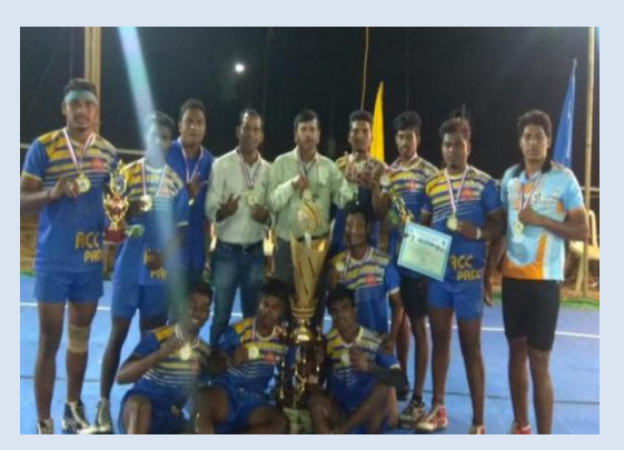
Kabaddi men's team champions of the intercollegiate Tournament 2018-19 organised by Sant Soirobanath Ambeye govt. College of arts and commerce, virnoda, pernem- goa.

The department of physical education and sports, trained teams for participation in the Intercollegiate tournaments organised by the Goa University and other sports associations. The College teams participated in the Inter-collegiate events organised by Goa University that includedBadminton Tournament (men and women), Table Tennis Tournament (for men), Cross country race, Tennikoit Tournament,Football Tournament (men), Athletic meet, Kabaddi Tournament (men and women),Volleyball Tournament (men), Kho-Kho