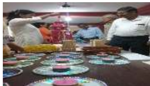
Students display and sell products made by them

Students made beautiful and creative hand-made items such as bags, lamps, candles, vases, wall hangings, flowers, tablemats, doormats, door hangings, pen stands and paper bags.