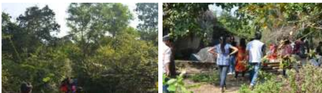
Students on a Field trip..... 'Let's go green'

Field Trip: On 16 th December, 2017, the council organised a field trip on the theme 'Let's go Green'. 112 students participated in the field trip.