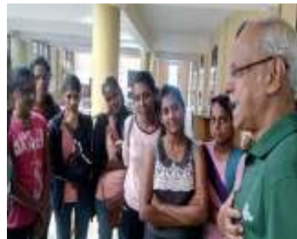
Students interact with Konkani writer, Mr. Damodar Mauzo.

Field Trip: On 3 rd March, 2018, the department organised a field trip to Harvale, Farmagudi and Mayem Lake. Thirty five students participated in the same.