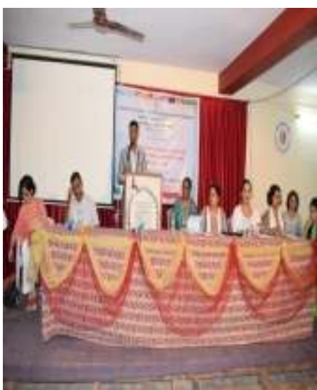
Technical sessions underway