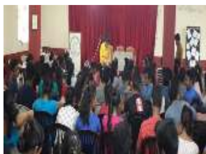
Students at the Cloth bag making workshop.

The bags were later distributing among vendors and shopkeepers in the Cuncolim Market. One hundred and eleven volunteers participated in the workshop held on 21 st September, 2017.