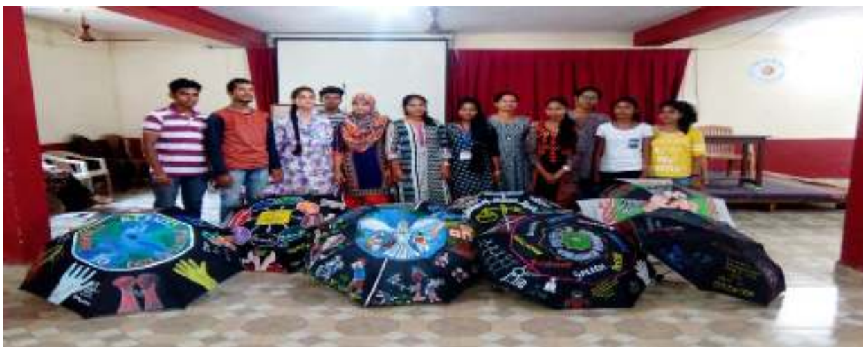
Participants display umbrellas they have painted.