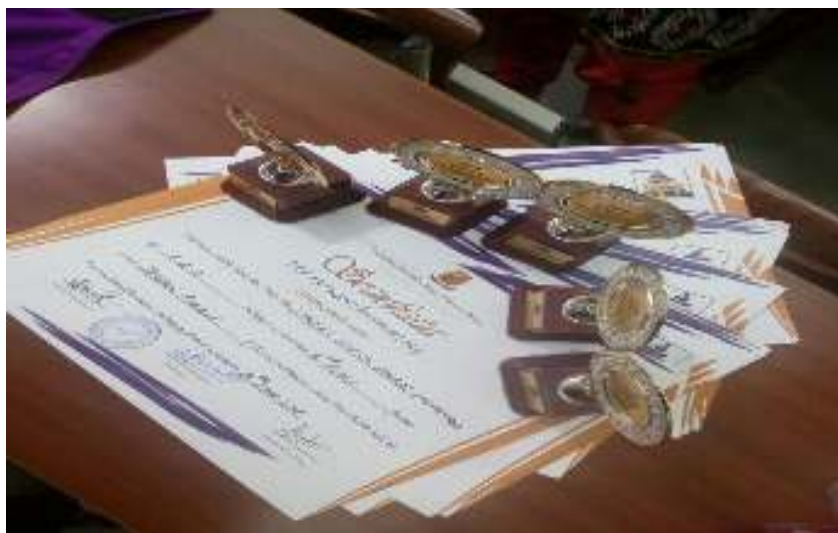
Prizes won at the Socio Fiesta.