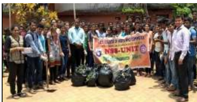
An initiative of the NSS Unit: A campus cleanliness drive.

The Unit organized a campus cleanliness drive on 2 nd August 2017. Hundred and fifty student volunteers participated in the cleanliness drive.