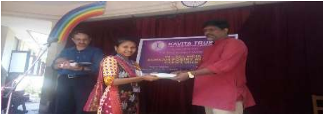
The organisers hand over certificate to our student