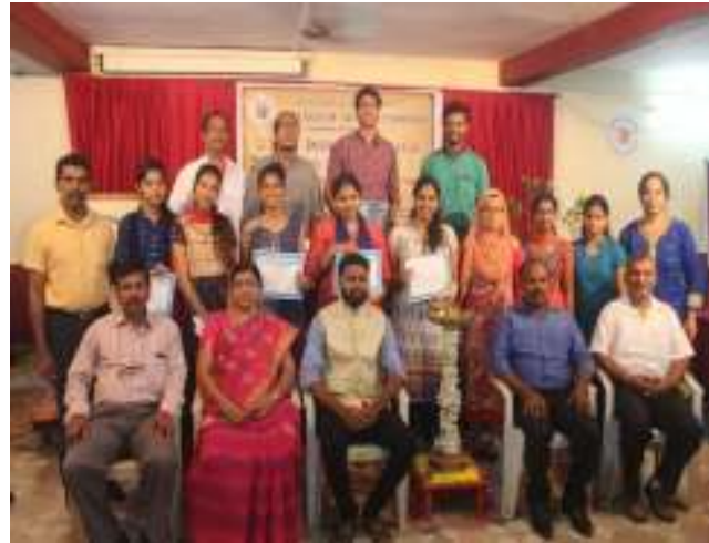
Winners of the Kavi Sammelan.