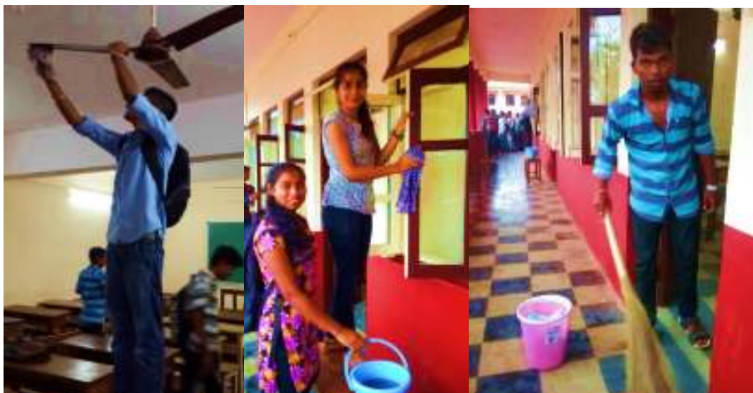
Volunteers clean their classroom

On 2 nd October 2017, the Unit organised a programme to celebrate Gandhi Jayanti. It began at 8.30am. It was a joint programme, wherein students of Cuncolim United High School and Higher Secondary School and those from the Bal Mandir participated. Various songs, poems and speeches based on Gandhiji's life and principles were presented by the students. The volunteers also cleaned classrooms depicting dignity of labour and the enthusiasm towards clean surroundings.