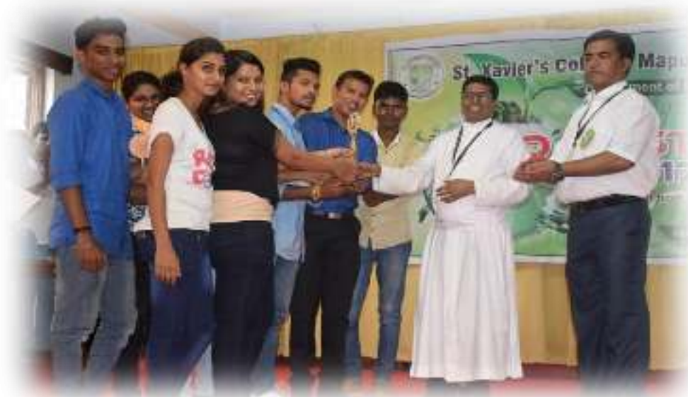
‘Runners up’ ‘GEO-FEAST’-2017.

On 2 nd March, 2017, sixteen students from the department participated in the State Level event ‘GEO-FEAST’-2017. The event was organized by St. Xavier College of Arts, Science and Commerce, Mapusa, Goa. Our team won the ‘Runners up’ position.