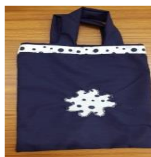
A Cloth Bag made at the workshop.