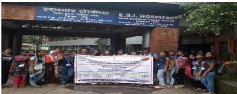
Volunteers at the ESI Hospital

On 21 st September, 2017, twenty volunteers offered their services in the Rashtriya Voyashri Yojana Assessment Camp held at E.S.I. Hospital at Navelim. They assisted senior Citizens in undergoing a medical check-up