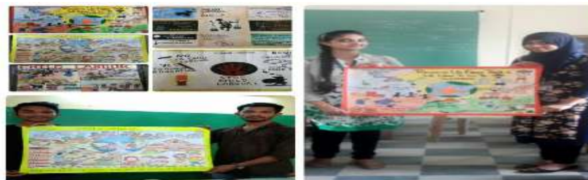
Poster made by participants.