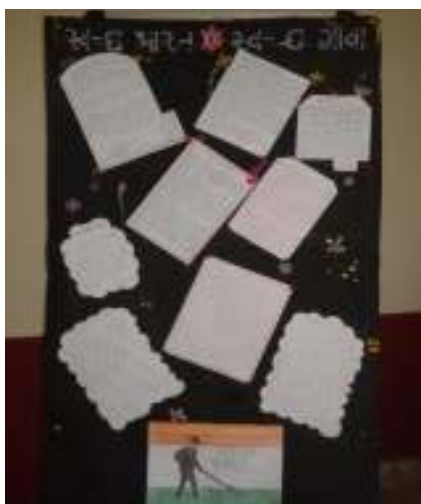
A Wall paper by the students.