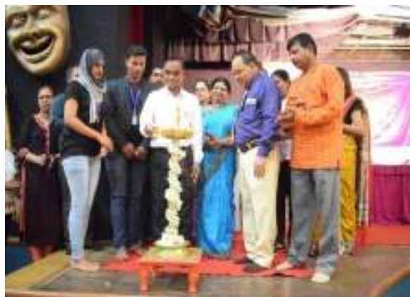
The stage set for KNACK 2018