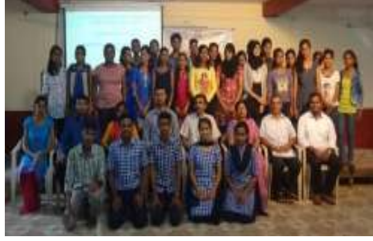
Participants attend the Sanskrit Shibir.