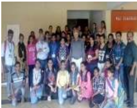
Students at Sangaman 2022.

Sangaman 2022: On 7 th and 8 th October 2017, thirty three students from the department participated in 'Sangaman 2022', held at Ravindra Bhavan Margao