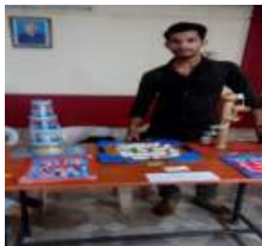
Participants display their products. at the Mela.