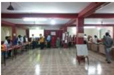
Swadeshi Mela 2017

Students made beautiful and creative hand-made items such as bags, lamps, candles, vases, wall hangings, flowers, tablemats, doormats, door hangings, pen stands and paper bags.