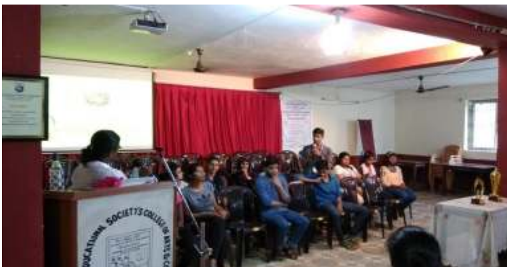
Students participate in the Spelling Competition.