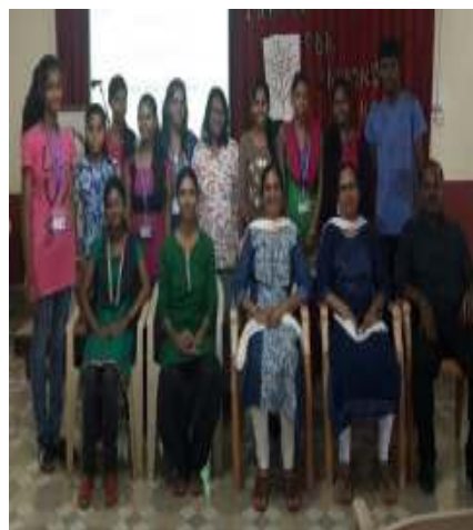
Participants of Kavyavachan

From the 06 th to 09 th August, 2017, a 4 days' workshop was organized for T. Y. B. A. students. They were taught Devanagari script typing. To celebrate 'Hindi saptah,' the department organized an Inter-Class Essay Competition, vartani lekhan & kavyavachan pratiyogita, from 14 th September to 19 th September, 2017.