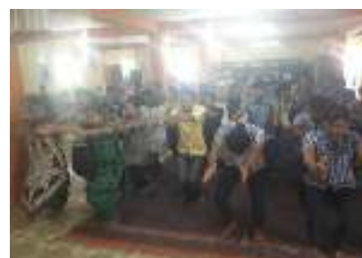
Students perform yoga asanas