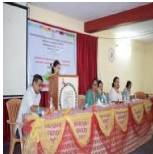
Participants present papers at the seminar.