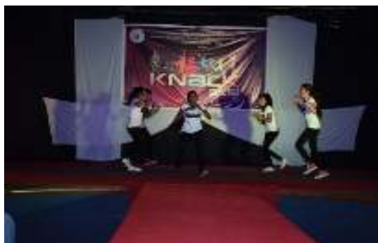
A dance performs at the event.