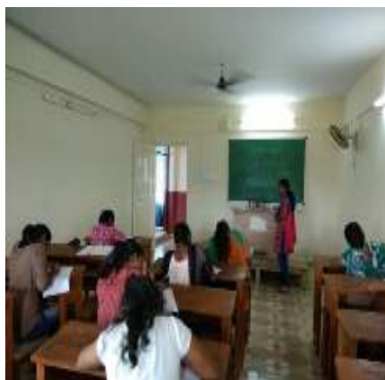
Essay writing Competition.

From the 06 th to 09 th August, 2017, a 4 days' workshop was organized for T. Y. B. A. students. They were taught Devanagari script typing. To celebrate 'Hindi saptah,' the department organized an Inter-Class Essay Competition, vartani lekhan & kavyavachan pratiyogita, from 14 th September to 19 th September, 2017.