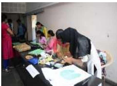
Participants make posters.

Poster Making Competition on the themes: Save the Girl Child, Impacts of Social Media on Youth and Nitol Goem, Nirmoll Goem.