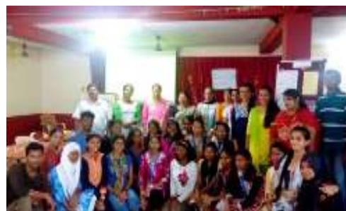
Participants ...of Swadeshi Mela