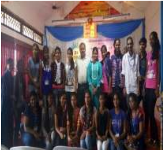
Students at the Yuva Konkani Sahitya Samelan.