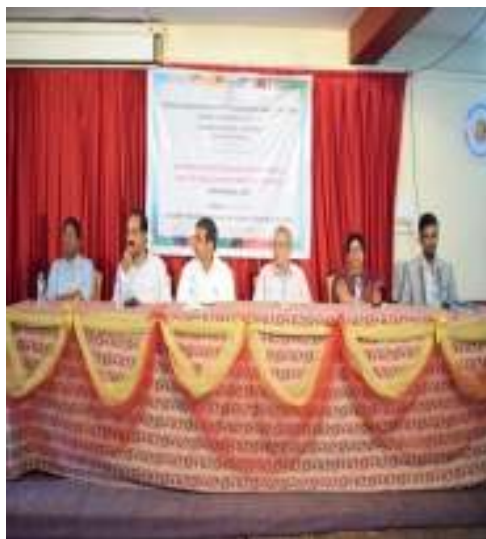
Inaugural session of the Seminar.

Theme of the Seminar: Higher Education is a matter of concern in recent years. Across the globe educationists debate in making education more enriching. Language and Literature teaching has also been a global concern in higher education across different cultures. Therefore the department felt it befitting to select the topic “Revisiting Higher Education, Culture Studies, English Language and Literature teaching” as it would benefit contemporary discourse. Research Scholars from all over India presented papers on diverse topics.