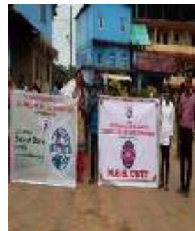
Students participate in the Swatchata Rally.