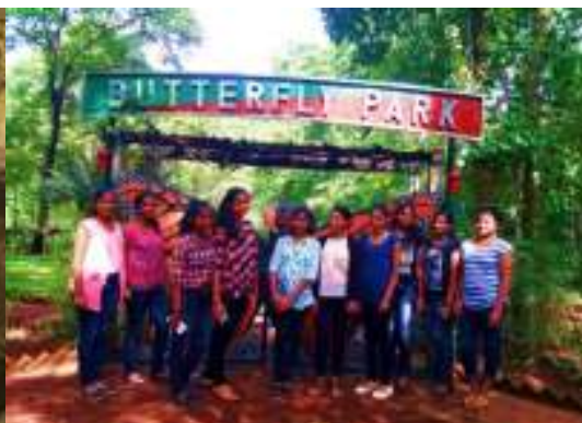
Students at the Butterfly Park.