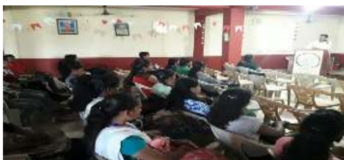
Students participate in the talk.