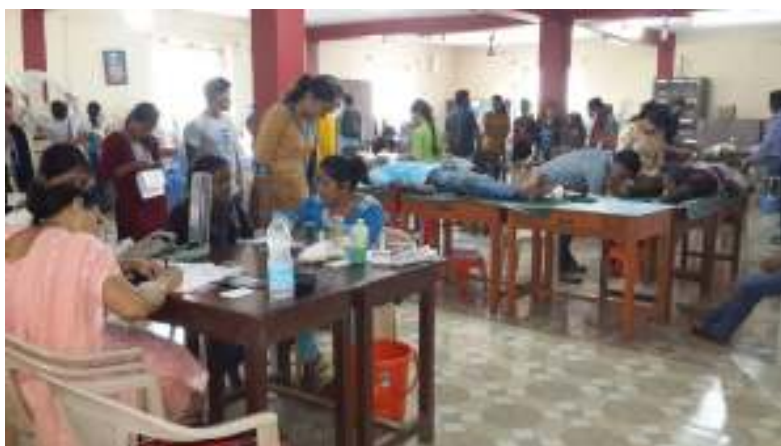
Blood Donation Camp: staff and students donated blood.