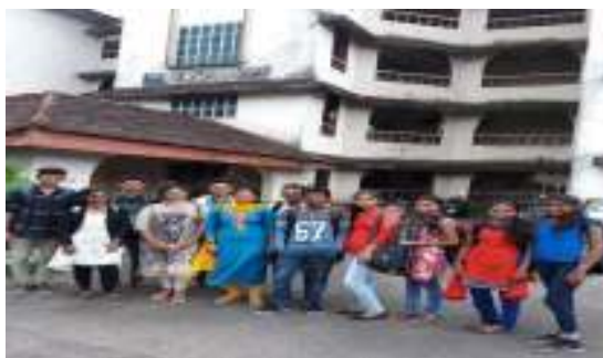
Students on a visit to the District and Session Court, Margao, South Goa