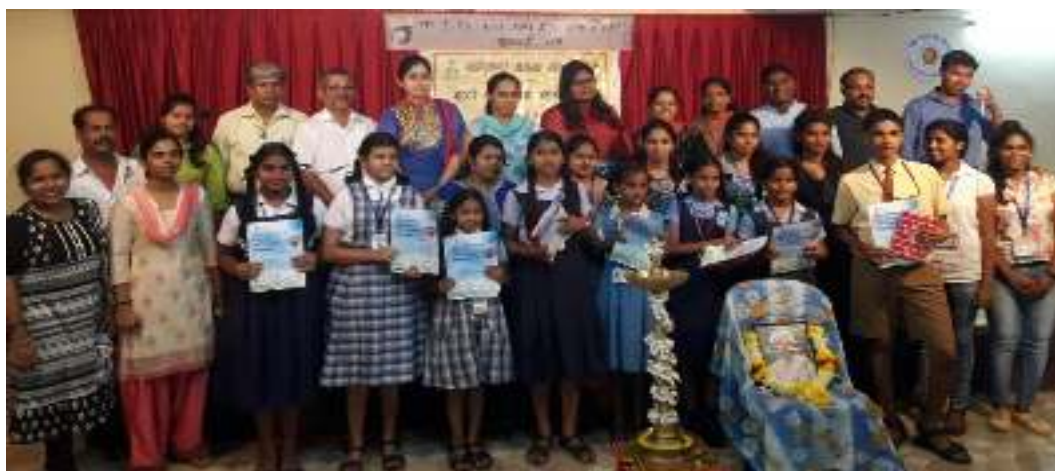
Winners: Story Telling Competition.