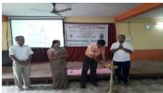
The lamp lit to initiate the yoga day celebrations.