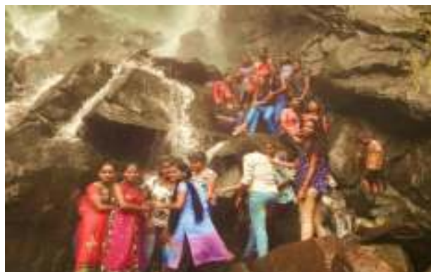
Students enjoy the eco-track.

On 21 st July, 2017, the Unit organized an eco-track to Kuskem waterfall, Canacona. The objective of the track was to help students inculcate love for mother earth. Around 150 students participated in the track. Students also visited Khotigao wildlife Sanctuary.