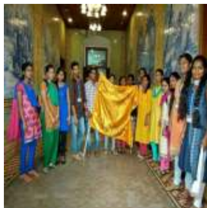
Students from the department on a study tour