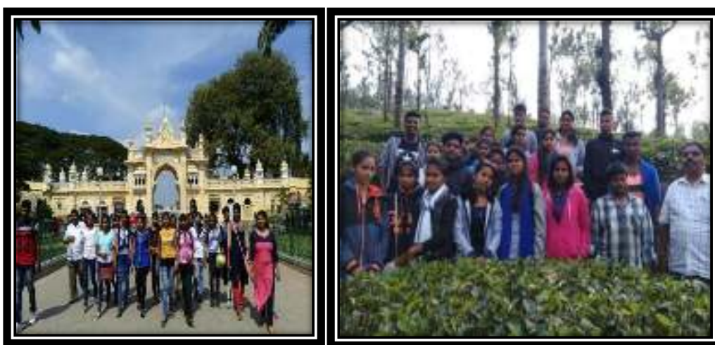
A Study Tour to Bangalore, Mysore, Ooty, and Coorg.