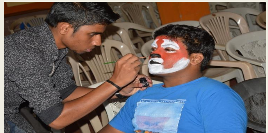
Students participate in the event 'Talent Hunt 2015'.