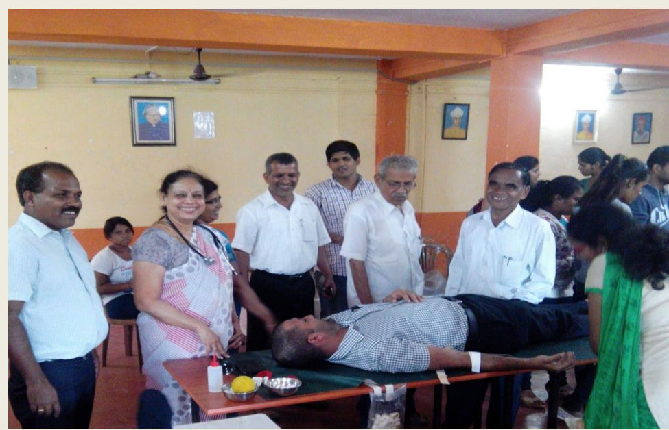
The blood donation camp in progress.

Bank, Hospicio Hospital, Margao, delivered a talk on the need of Blood Donation for the benefit of needy. She also helped student's clear doubts regarding Blood Donation.