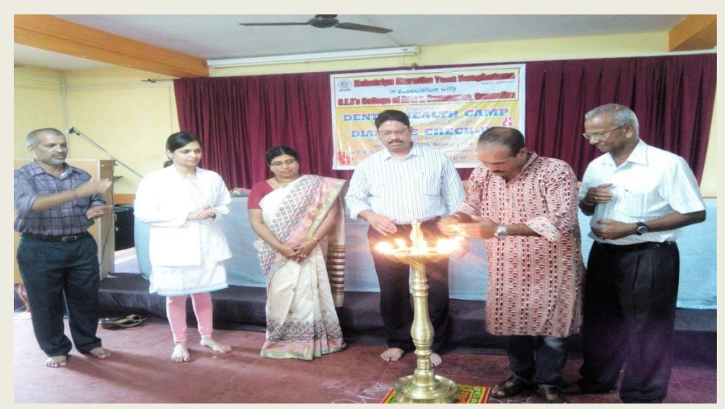
Dignatories present at the inauguration of the Medical Camp.

On 20th August, 2015, the Unit organized a Dental Health Camp and a Diabetes check-up Camp, The Camp was held in association with Goa Dental College and Bayer Pharmaceuticals. A team of 10 Doctors checked hundred people. NSS Volunteers helped in the smooth conduct of the Camp.