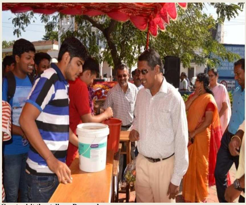
Guests visit the stalls on Bazaar day.

Father Agnel College, Pillar, State Level Workshop at Vidya Prabodhini College, Porvorim, Seminar of Management of Transport (Traffic) in Goa conducted by Goa Legislators' Forum, Panaji, and Poster Competiton , 2015 organized by P.H.C. Balli. They won various prizes.