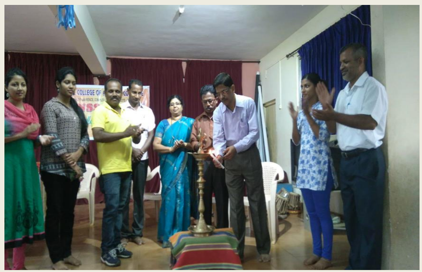
The guest inaugurates the Annual special camp.