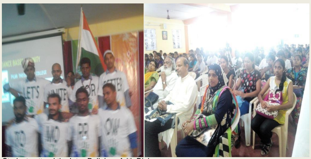
Students attend the Inter-Religious faith Dialogue.

On Saturday, the 29<sup>th</sup> August, 2015, the unit organised an Interfaith Dialogue Programme, in collaboration with the Pilar Theological Society, Pilar Goa.NSS volunteers helped in planning and organising the same.