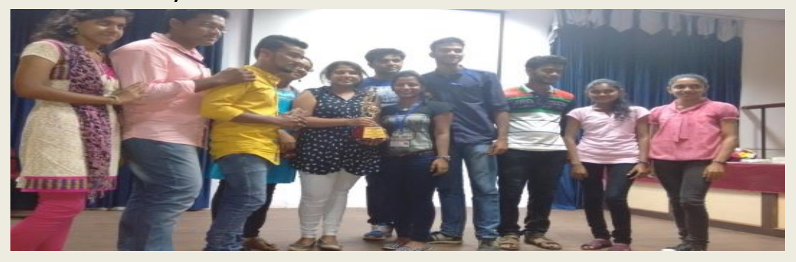
Participants of the Political Science Festival

On 5<sup>th</sup> March 2016, students participated in the 3rd Annual 'Political Science Festival' organised by Political Science Department of the Goa University.