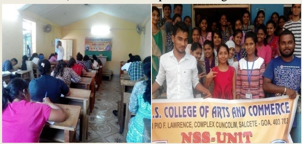
Students participate in the events to celebrate NSS Day.

On the occasion of NSS Day, on 24<sup>th</sup> September 2015, an essay writing competition was organized for students. The topics for were 1) My Role in Nation Building 2) Service to Mankind is Divine and 3) Personal Development through NSS.