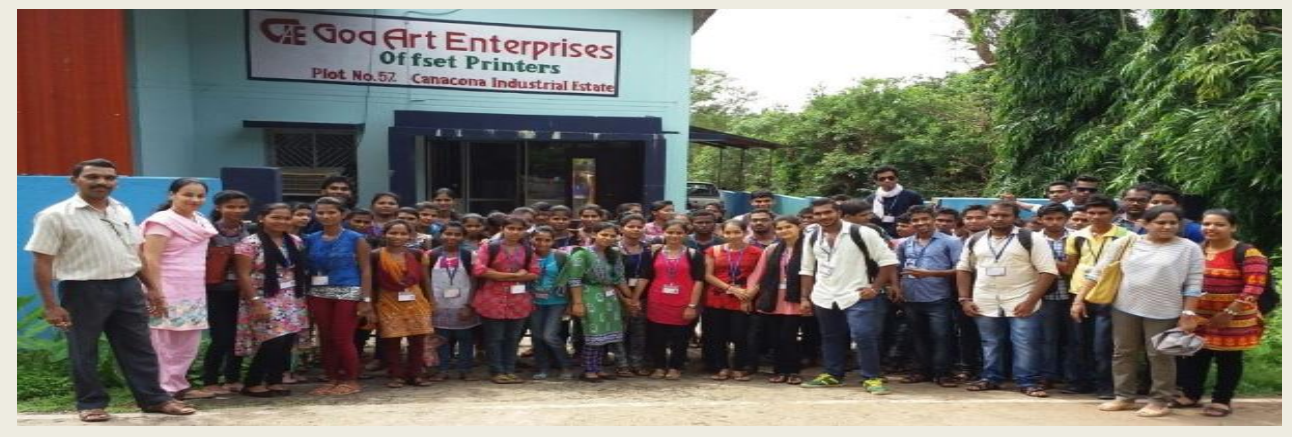
Students at the Goa Art Enterprises, Canacona.