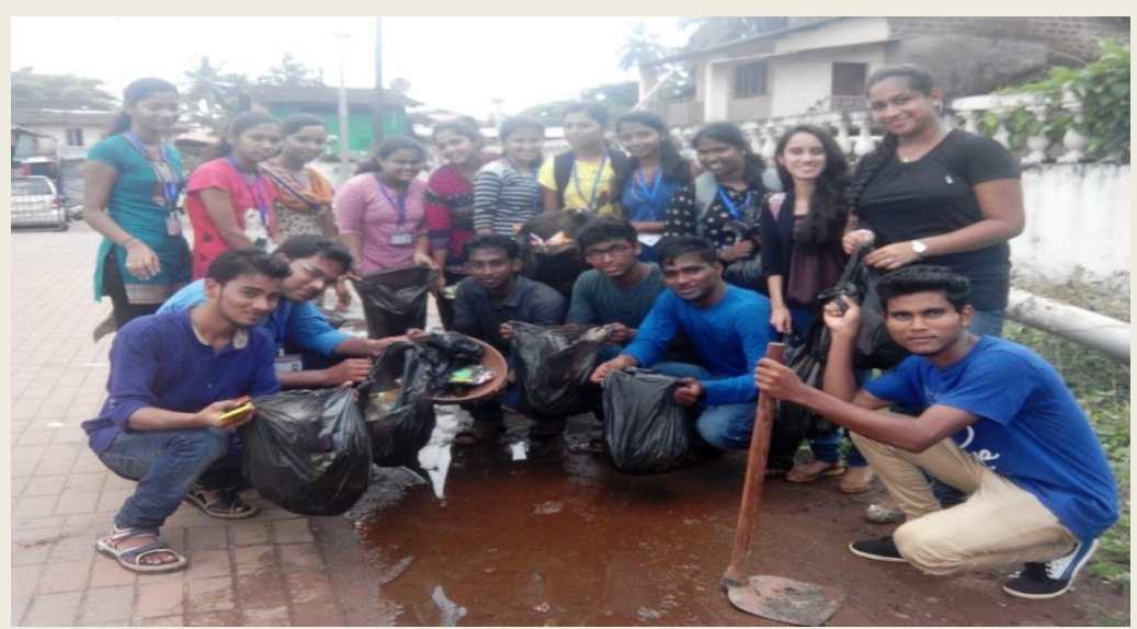
Students participate in the cleanliness drive.

As a part of the 'Swach Bharat Abhiyan' a Cleanliness Drive was organized on Friday, the 14<sup>th</sup> August, 2015. Students were allotted places to be cleaned. The entire College Campus, Class rooms, Higher Secondary Campus, School Campus, Church Compound and Market area were cleaned. 167 volunteers took part in this drive.