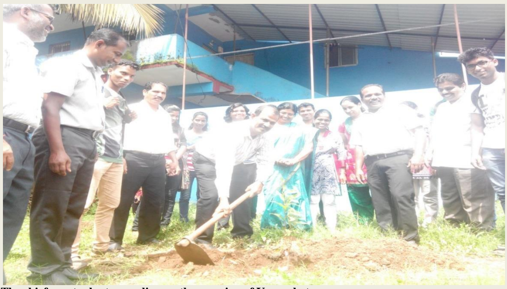
The chief guest, plants a sapling on the occasion of Vanmahotsava

The Unit organized a Vanmahotsava Programme on 21st July, 2015.