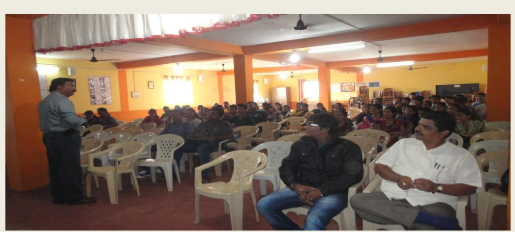
Students at the workshop on Arts and Animation

Department of Physical Education and Sports : The Department of Physical Education and Sports prepared different teams for participation in various sports event conducted by the Goa University and other Sports Organisations.